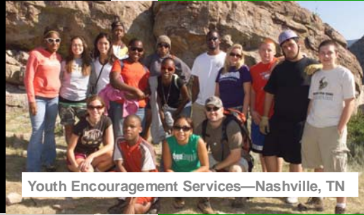
Youth Encouragement Services—Nashville, TN